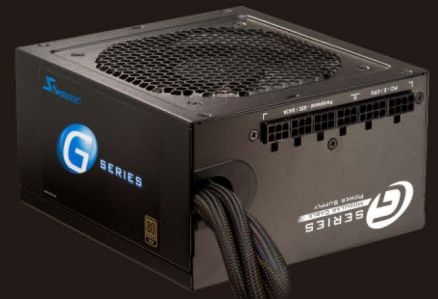
• Detachable Modular Cable: 750/650/550/450W