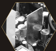
High Quality 105°C E-Cap