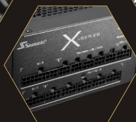
Patented DC connector Module