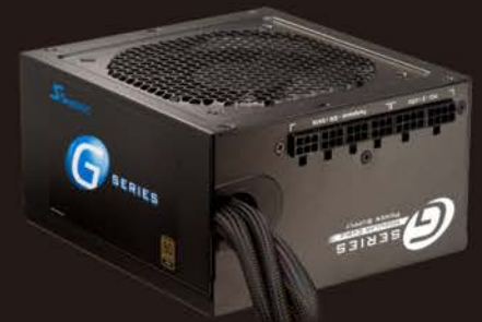
• Detachable Modular Cable: 750/650/550/450W