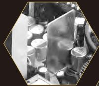
High Quality 105°C Cap