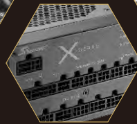
Patented DC connector Module